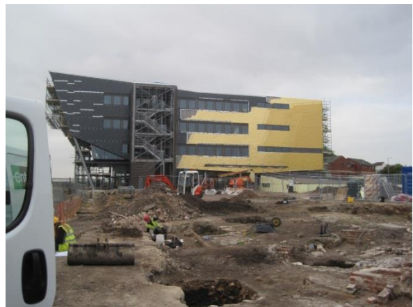
Archaeological excavation being undertaken in advance of construction, C4Di, Hull