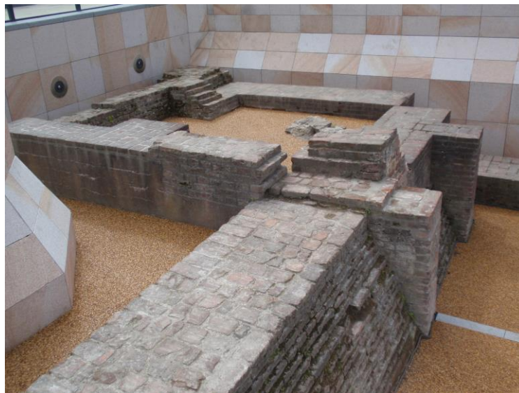
Remains of Beverley Gate and town wall on display, Hull city centre

3.3 The following heritage assets (designated under the relevant legislation) are World Heritage sites, Scheduled Monuments, Listed Buildings, Registered Parks and Gardens, Registered Battlefield, Protected Wreck site and Conservation Areas. Conservation Areas are designated at local authority level by Full Council and the former are designated at national level by the Secretary of State for Culture, Media & Sport on the advice and guidance of Historic England. Schedules of the nationally designated heritage assets can be viewed online via the National Heritage List for England at www.historicengland.org.uk . For Conservation Area boundaries and adopted Conservation Area character appraisals and management plans, these can be viewed on the Council's website ( www.hull.gov.uk ).