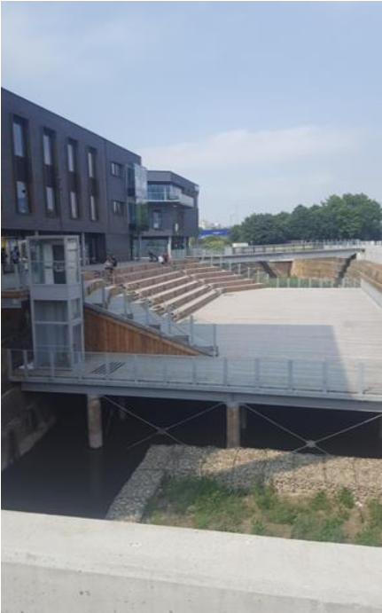
Reuse of disused dry dock (industrial archaeological asset)