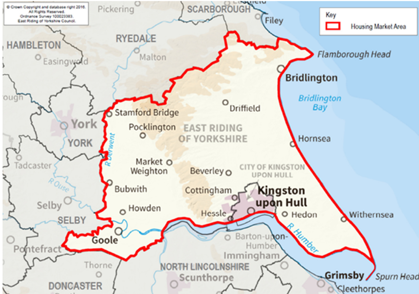
Map 5.A: Hull and East Riding Housing Market Area [to follow para 5.3]