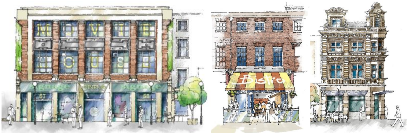
Concept designs for frontage improvements to buildings

Grants will cover up to 50% of the total project costs, helping to overcome barriers which have prevented private sector investment in the street. The scheme will unlock the full potential of Whitefriargate, encouraging new leisure, boutique retail and food & beverage uses that will ensure that the street remains sustainable over the long term.