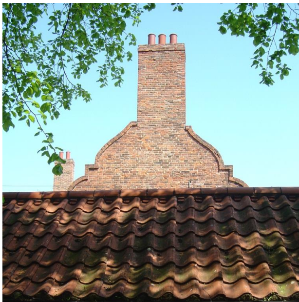
Dutch –style shaped gables and pantiles on the Master's House, Charterhouse, Hull c. 1650

century still survive: in most years it was producing upwards of 90,000 bricks – many of which were probably used in the construction of Hull's public buildings, and later it's Town Walls.