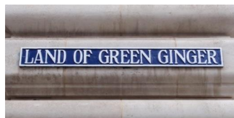
Old street name, Hull Old Town