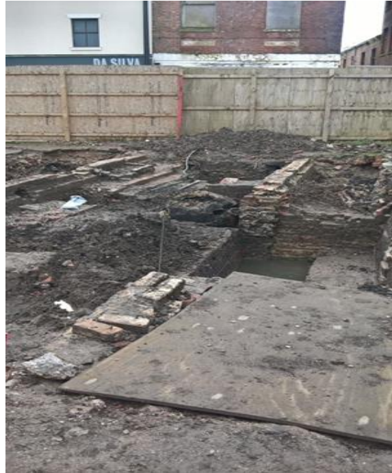
Archaeological excavation at Fruit Market, Hull

7.2 If archaeological features are present within the site area, (identified through archaeological evaluation, or known to survive), archaeological mitigation may be advised, as a condition on a planning application to secure the works.