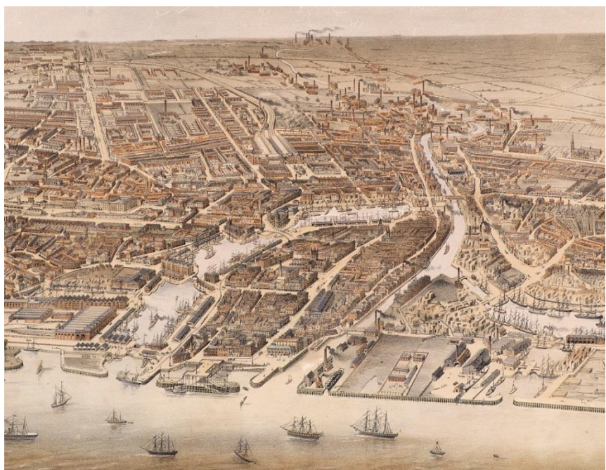
Bird's-eye view of Hull by Frank Pettingell, 1880