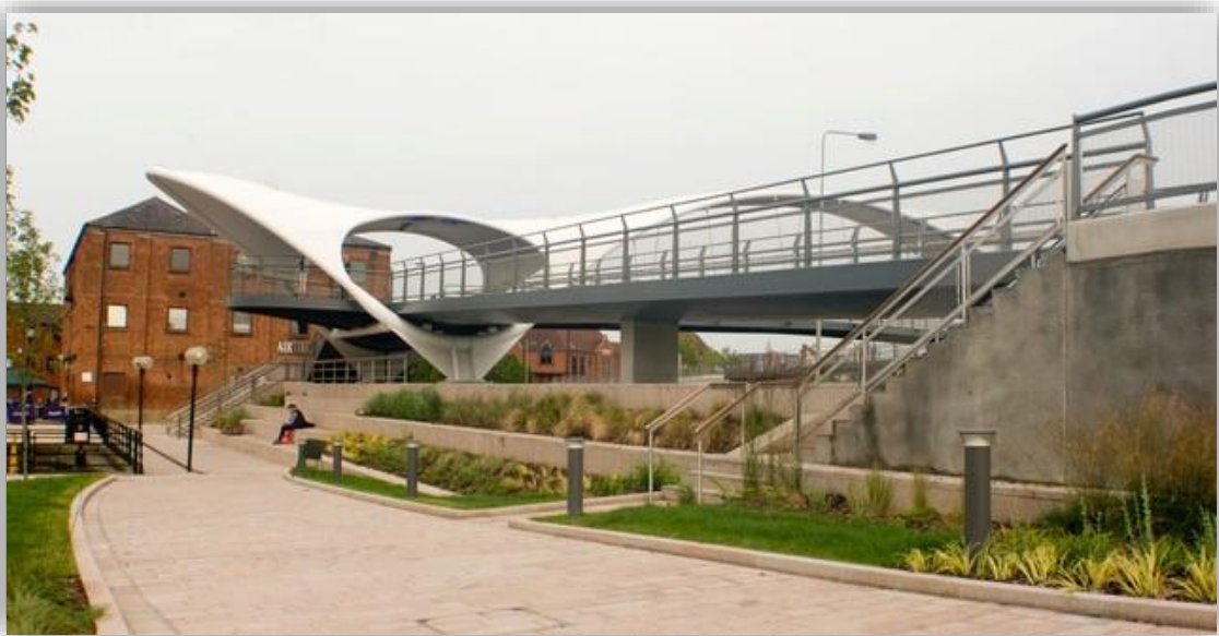
Castle Street Bridge